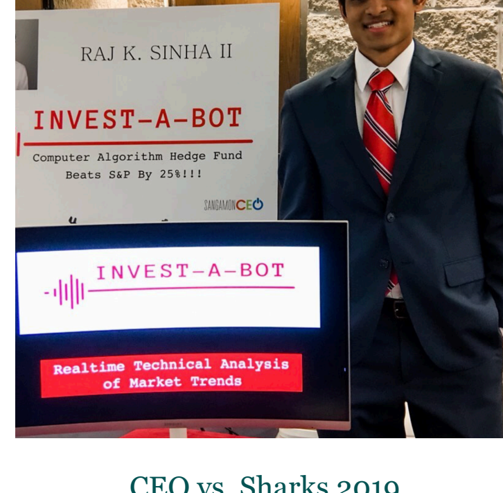
CEO vs. Sharks 2019