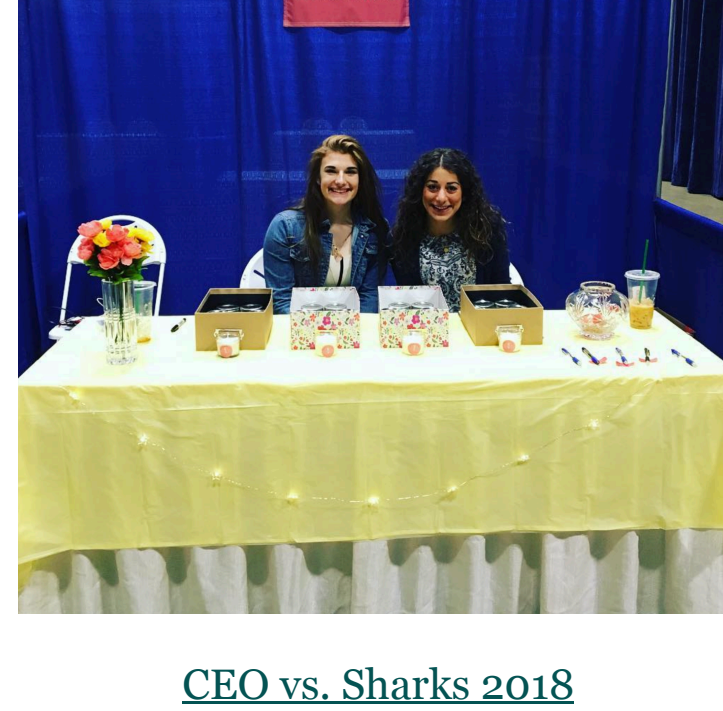
CEO vs. Sharks 2018